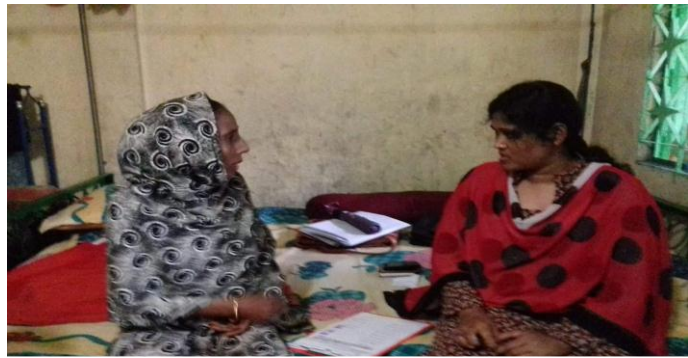
Home visit conducted at chatak, Sylhet

Some PLHIV are seriously ill, ART dropout and financially insolvent. They couldn't go to any health care center to receive health service. Sometime family member/ caregiver couldn't support them. To ensure ART adherence and maintain health & hygiene by the ART receivers, community peer counselor contacted 25 times home based care support with collaboration of Govt. ART centers. This service is very helpful for PLHIV. But this service is very limited. These support can be increased in future.