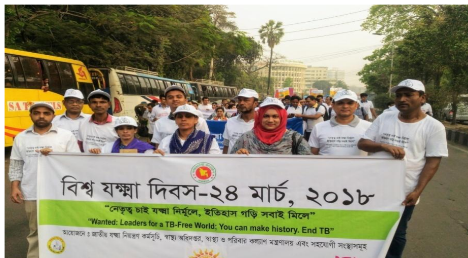
Rally on celebration of World TB Day 2018

World TB Day provides an opportunity to raise awareness about TB related problems, solutions and to support worldwide TB control efforts. To create awareness about TB among mass population 24 th March is observed as world TB day.