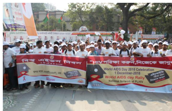
Discussion meeting and Rally on celebration of World AIDS Day 2018