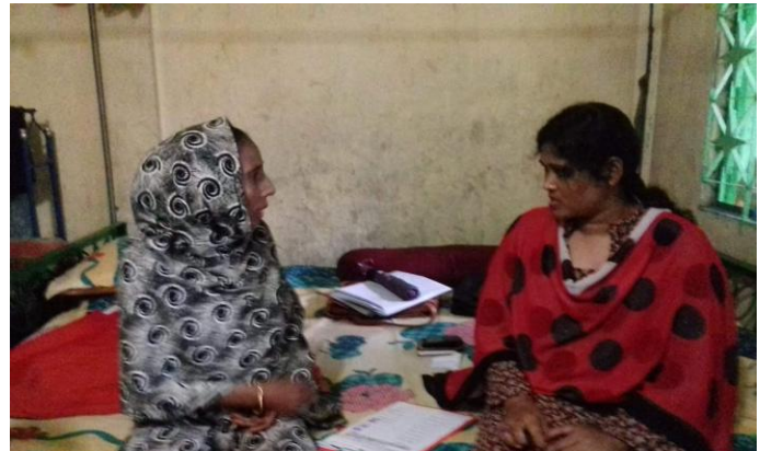
Home visit conducted at chatak, Sylhet

Some PLHIV are seriously ill, ART dropout and financially insolvent. They couldn't go to any health care center to receive health service. Sometime family member/ caregiver couldn't support them. To ensure ART adherence and maintain health & hygiene by the ART receivers, community peer counselor contacted 25 times home based care support with collaboration of Govt. ART centers. This service is very helpful for PLHIV. But this service is very limited. These support can be increased in future.