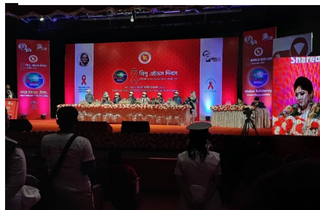
Discussion meeting and Standing Rally on celebration of World AIDS Day 2020